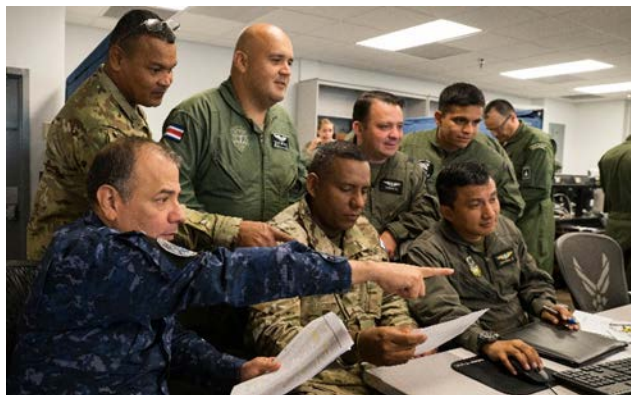
Service members from partner nation air forces work together during PANAMAX Aug. 14, 2017. The week-long exercise focused on security of the Panama Canal.

economic initiative—and the continued provision of financing and loans that appear to have ‘no strings attached’ provide ample opportunity for China to expand its influence over key regional