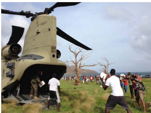
The DOD distributes USAID relief supplies in Dominica Sept. 27, 2017.

multinational organizations. The return on this investment was evident in 2017, with CDEMA, CARICOM, and the RSS playing critical roles in the regional response effort to Hurricanes Irma and Maria, and multiple nations providing assistance to their Caribbean neighbors. For our part, by leveraging flexible, dual-purpose SPMAGTF forces already in the region, we were able to