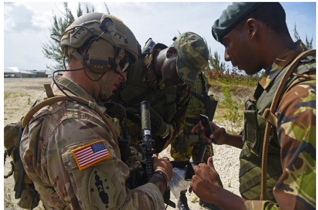
U.S. Army National Guardsman with Barbados Defence Force members during a USSOUTHCOM-sponsored Tradewinds Exercise June 8, 2017.

We regularly promote jointness in annual multinational exercises. Last year we supported the Dominican Republic's creation of a professional NCO Corps, South America's first-ever Senior Enlisted Conference, and continued regional leadership on effective gender integration in military and security forces and peacekeeping